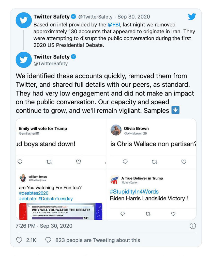
Figure 1. Twitter update on information operation efforts from Iran during a U.S. presidential debate.

meaning, or purpose" (pp. 70-71). He argued that the intended use of networked computers was to increase the availability of information, but it may have had the unintended consequence of creating an environment in which information is devalued and decontextualized.